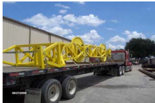
Schahin Cargo Truck Loadout