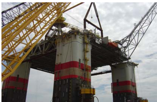
Blindfaith Topsides Integration