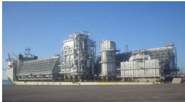
Loadout and Transportation of Escravos Cargos from France and Italy to Nigeria

American Global Maritime Inc. 11767 Katy Freeway, Suite 660 Houston, Texas 77079 Fax: +1 281 558 0541 Watts: +1 888 209 6569 Email: agm@globalmaritimeus.com Website: www.globalmaritime.com