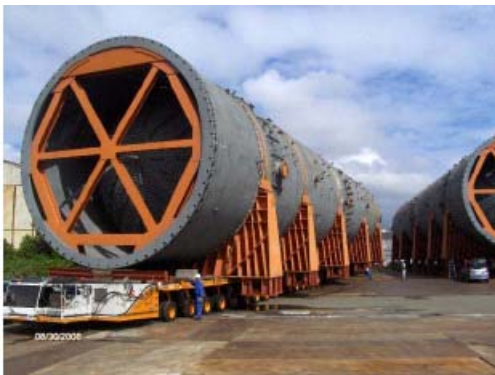
Loadout of Escravos Reactors in Japan