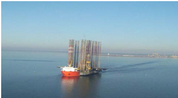
Dry Transport of 3 Jack-up Rigs